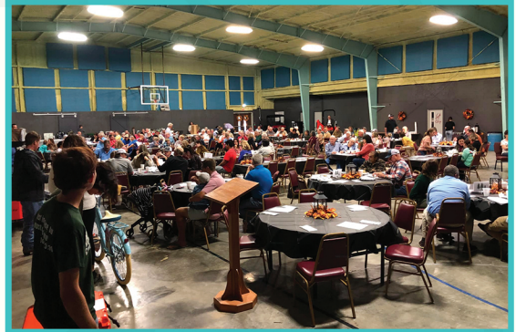
Photos of previous CPM auctions

Tickets available online at camppearl.com or through CPM Bible Churches